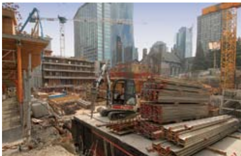
With the foundation and parkade complete, Patina and the new YMCA reach grade

Patina is scheduled for completion in early 2011 and the YMCA for early 2010.