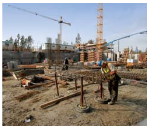
Excavation and foundation work is well underway

Tapestry Retirement Communities offer amenities and services that exceed traditional retirement living. At Tapestry choice is not a luxury but an essential part of each day. Residents experience dining, health, wellness, freedom and fun. Similar to a resort, Tapestry enhances the lifestyle of seniors who value their independence and want to be involved in a fun and active community with an excellent quality of life.