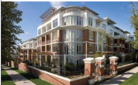
Chelsea – Concert's third residential development in Victoria is now complete

Chelsea's solid concrete construction ensures that its residences, much like the Fairfield neighbourhood that surrounds them, will stand the test of time. Chelsea homes offer two bedrooms plus den or two bedrooms plus den and family room and range in size from 1,072 – 1,552 square feet, with a limited number of penthouse suites encompassing up to 1,759 square feet.