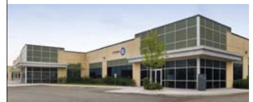
Dixie - Eglinton Centre – three multi-tenant buildings in Mississauga, ON

This exceptionally-located asset in the strong suburban Greater Toronto office market complements Concert's current holdings and increases the company's Ontario income producing portfolio to in excess of 2.1 million square feet.