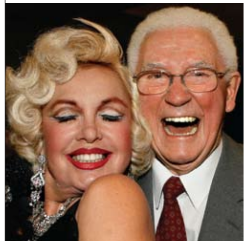
Celebrity impersonator, Marilyn Monroe, and guest at the Grand Opening of Tapestry at Village Gate West

The event provided an opportunity for Tapestry at Village Gate West to attract new prospects, offer tours of the property and demonstrate to all who attended what Tapestry Five-Star Fun is all about.