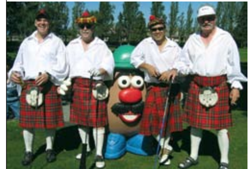
In the true spirit of the day, the team from Dominion Construction came dressed for the occasion