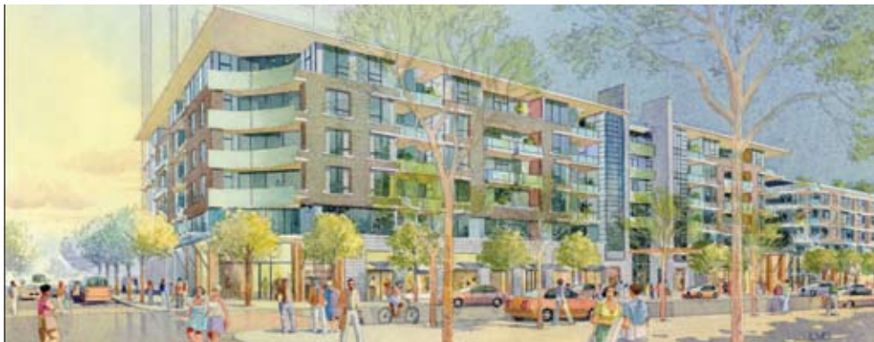
With any real estate development, location is a prime attribute. This is especially true for a Tapestry community.

With any real estate development, location is a prime attribute. This is especially true for a Tapestry community. Built to meet the highest industry standards, each Tapestry community is situated in a diverse neighbourhood within easy reach of the area's best attractions and destinations. Nearby there are shops and